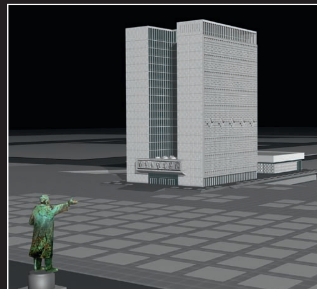
B. Mezentsev, B. Zaritzkiy, E. Rozanov, V. Shestopalov Lenin Square (Tashkent), 1965 3D visualization

tectural practices. Three particular topics will be specifically discussed: the socialistic melting pot in Central-Asian urbanism, the use of water in public spaces, and the »Petersburgization« of the historic heritage in old cities.