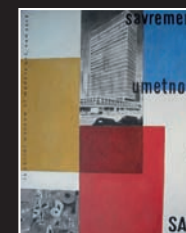
»Modern Art in the USA« Collection of the Museum of American Art

A long time ago in a land that was great but without a tradition in art, an art museum was opened. This museum was so adventurous and innovative that it succeeded in reinventing modern art. Encouraged by this achievement, it began sending exhibitions across the vast land, spreading the idea of modernism, and soon after it became widely known as The Modern.