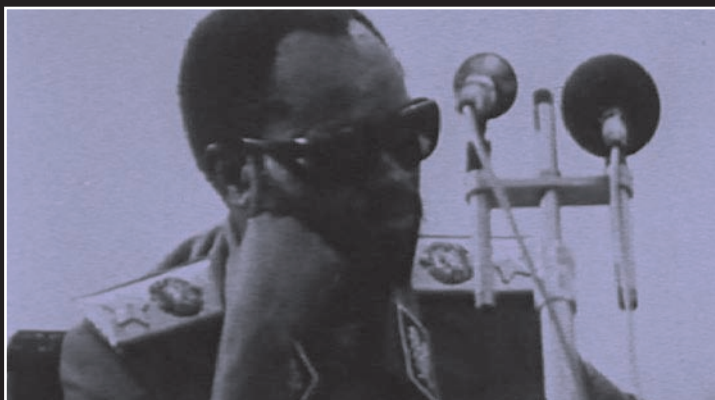
Still taken from »Os Comprometidos — Actas de um processo de descolonização«, Mozambique INC 1983

Party and the State, and thousands of Mozambicans who were committed to repressive colonial-fascist organizations. Concrete reasons and actions led to the accomplishment of this meeting, but when