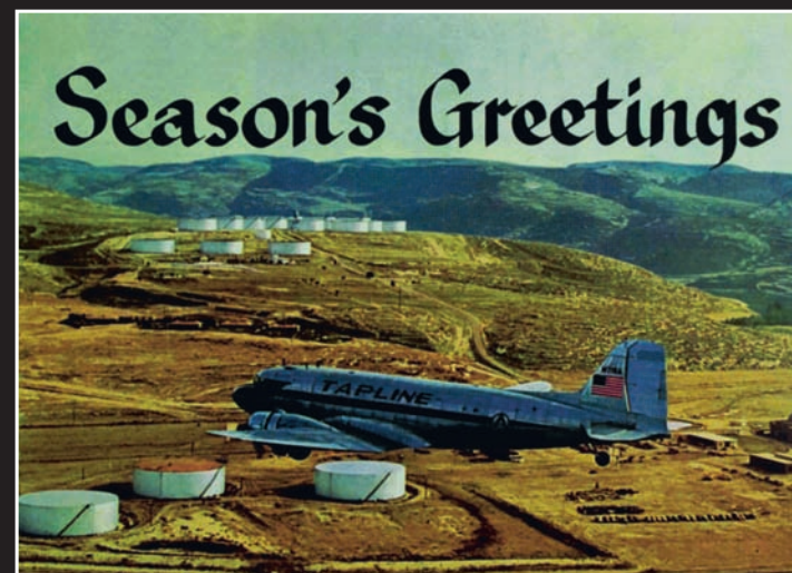
Seasons Greetings. An Annotated postcard

The Trans-Arabian Pipeline Company built the world's longest pipeline linking Saudi Arabia to Lebanon. By examining a greeting card, circulated by the company to its employees in the early 60s, this talk will uncover the elements that make up this image and discuss the creation of an American corporate identity.